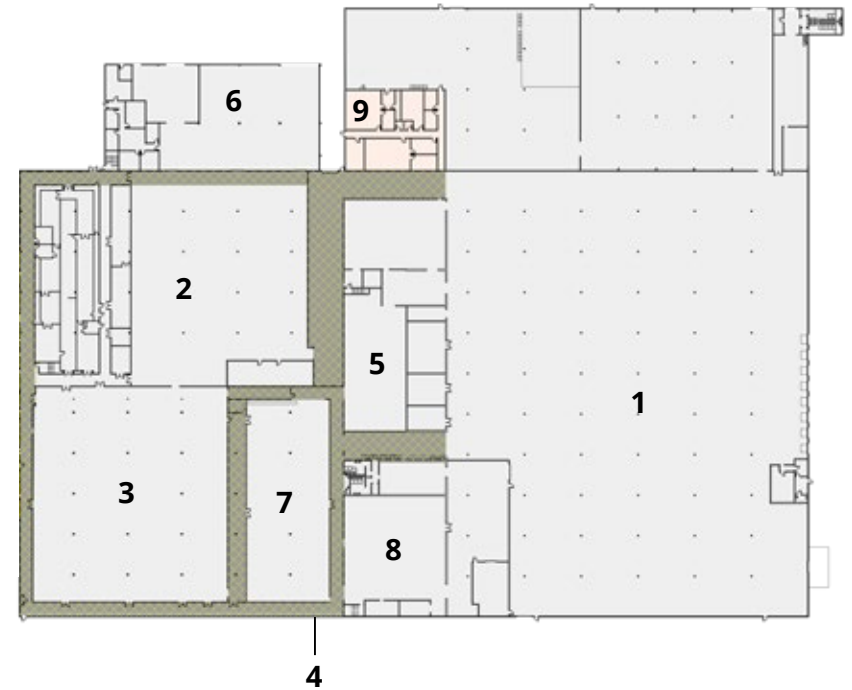
BUILDING 4 FLOOR PLAN