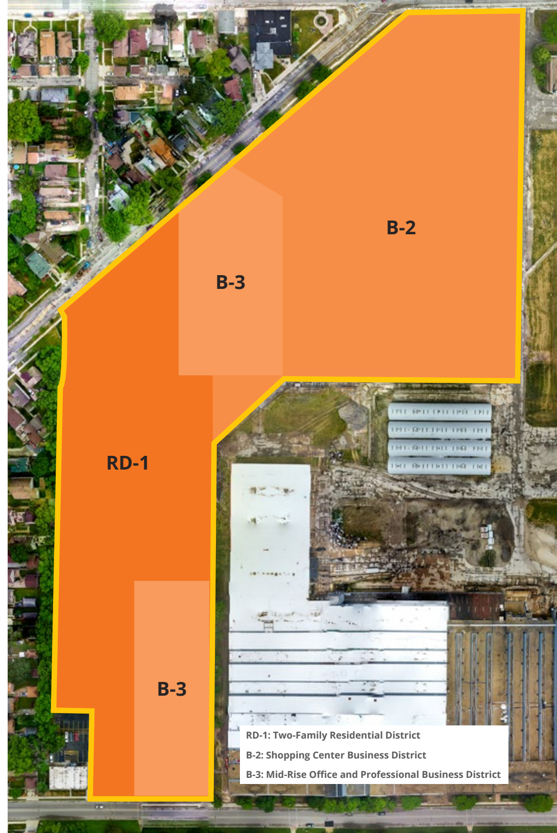
RD-1: Two-Family Residential District B-2: Shopping Center Business District B-3: Mid-Rise Office and Professional Business District